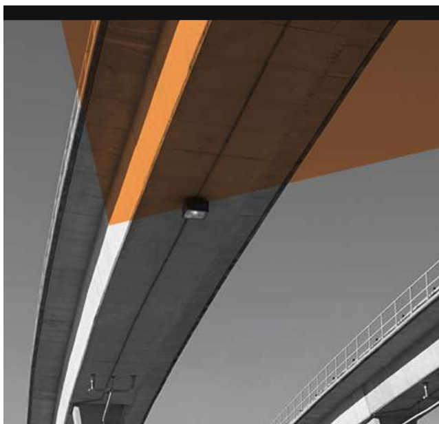
EXHIBIT ALONGSIDE LEADERS FROM YOUR MARKET